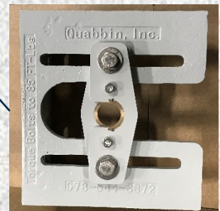
Split stem guide assembly