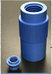
Operator nuts (Q-Blue and others)

Quabbin, Inc. can diagnose the problem with your water control system and provide replacement components