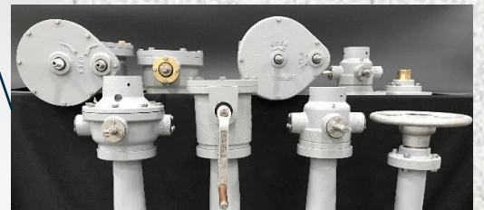
Manual hoists, cranks, handwheels