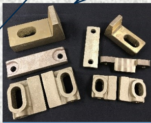
Top, side, bottom wedges