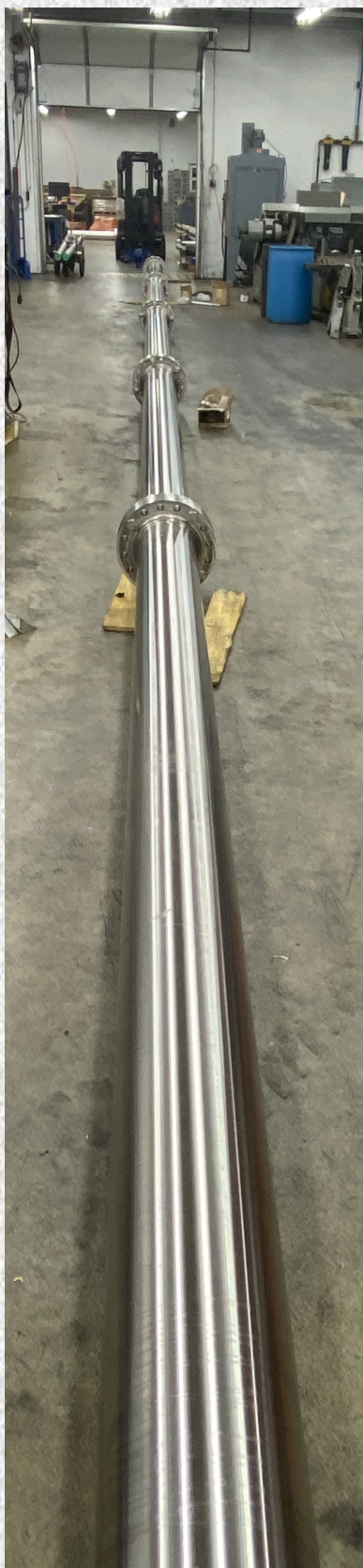
Four of the 13 sections needed to replace each of the three Upper Cylinder Gate Stems.