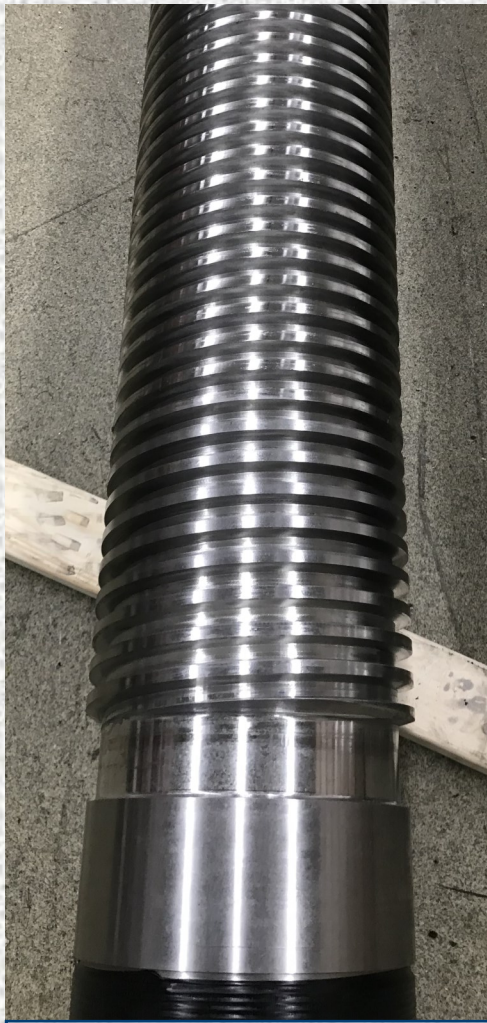
An upper gate stem screw, 10"-1 TPI Acme thread, 16 Ra.