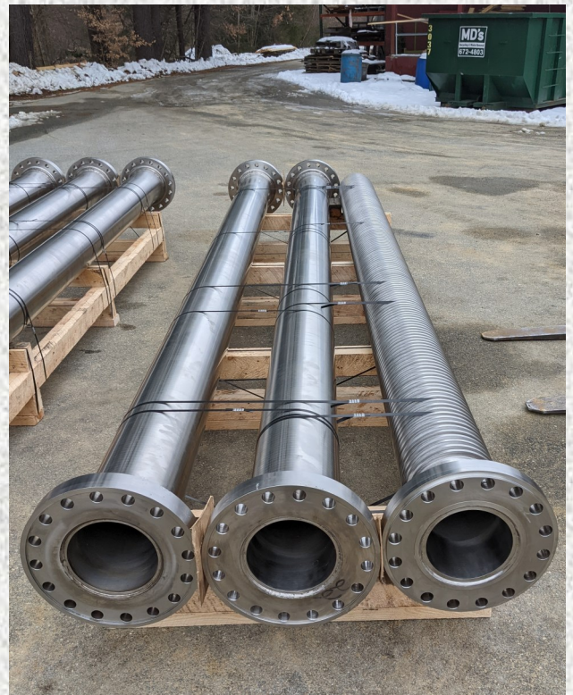
Two upper gate stems and one screw (far right) await shipment to Hoover Dam in Nevada.