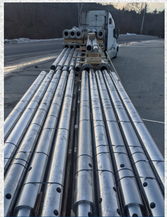
One of seven truckloads of replacement components on its way to the Hoover Dam.