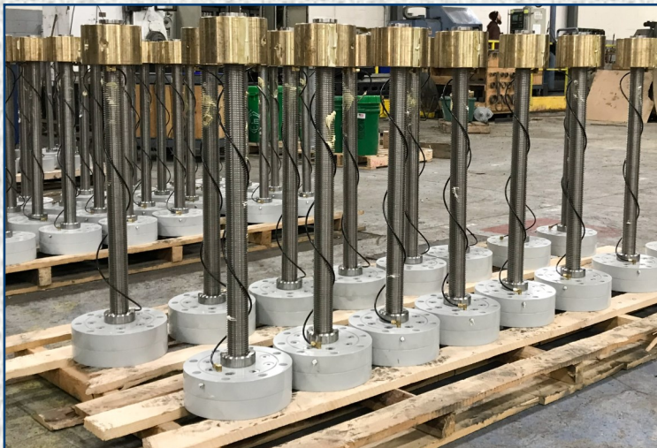
Partially assembled jack stands in line for testing.