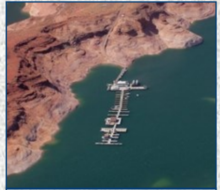
Dangling Rope Marina, Lake Powell.

Quabbin designed and built 72 jack stands for Dangling Rope Marina in Kane County, Utah, managed by the National Park Service and part of the Lake Powell Glen Canyon National Recreation Area. Seasonal fluctuations in the water level have made it difficult for boats to use the dock in the summer. Quabbin worked with HDR to design jack stands to raise and lower the 900-foot-long dock by up to 24 inches to maintain the docks' proper height in relation to the water level.