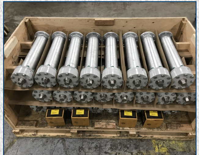
Assembled jack stands packed for shipping.